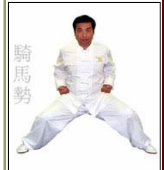
Grandmaster Shyun Demonstrating Horse Stance

“A complete martial arts system such as Eight Step Preying Mantis Kung Fu, encompasses everything you need to live a full, active, and healthy life.”