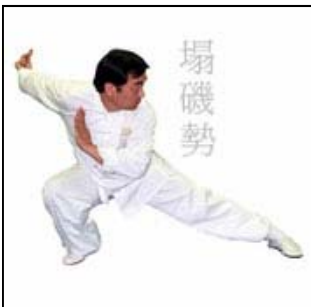
Grandmaster Shyun Demonstrating Falling Stance