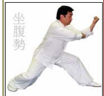
Grandmaster Shyun Demonstrating 50/50 Stance

"Our bodies and the environment in which we choose to live, naturally engage in a balancing act which makes Abimoxi medicine a complex, yet fundamentally clear-cut form of medicine."