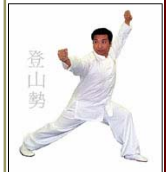
Grandmaster Shyun Demonstrating Bow Stance

“A complete martial arts system such as Eight Step Preying Mantis Kung Fu, encompasses everything you need to live a full, active, and healthy life.”