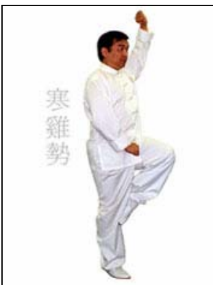
Grandmaster Shyun Demonstrating Single Leg Stance