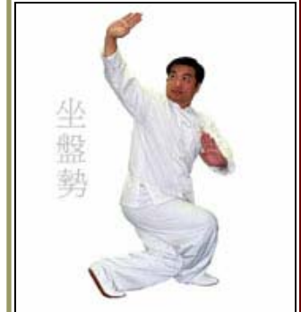
Grandmaster Shyun Demonstrating Crossing Leg Stance

"Our bodies and the environment in which we choose to live, naturally engage in a balancing act which makes Abimoxi medicine a complex, yet fundamentally clear-cut form of medicine."